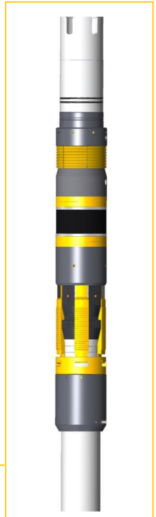
F1 High Capacity Liner Hanger Packer

Other sizes are available on request. ID may vary depending on connecting configuration selected.